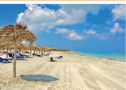
IBEROSTAR Playa Alameda