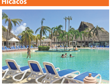
Starfish Cuatro Palmas