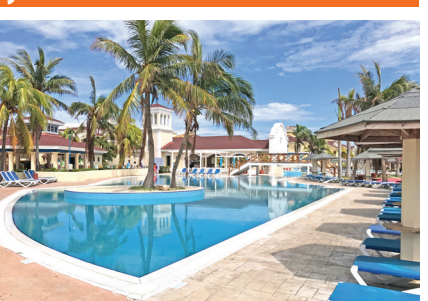
IBEROSTAR Bella Vista